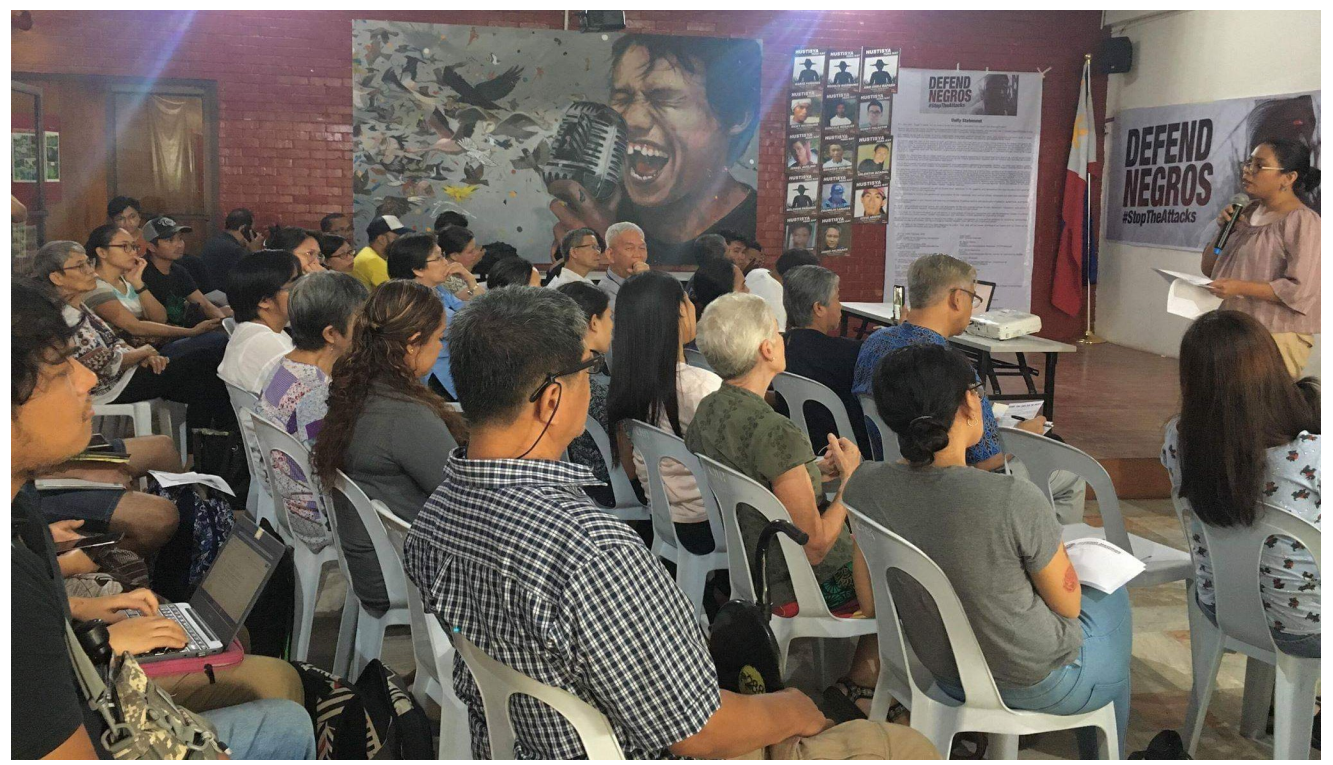
Launching of Defend Negros #StopTheAttacks Network at Commission of Human Rights (CHR), Quezon City.

The Negros formation of the Defend #StopTheAttacks Network on June 22, 2019 is timely in the face of the continuing human rights violations. According to the Northern Negros Alliance of Human Rights Advocates (NNAHRA) and various fact sheets these violations were bv state forces (2nd committed Negros Occidental Provincial Mobile Company and 62<sup>nd</sup> Infantry Batallion, PA, Silay City PNP elements, elements of 79th IB PA, SCAA paramilitary elements under the Philippine Army, PNP-SAF, and Joint Investigating Task Group, RPA, 6th SAF-SAB, RMF, 33rd CMO Company), suspected armed goons of the land owner and security guards of different landlords in Negros Islands.